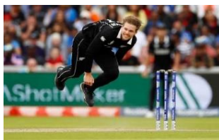
Lockie Ferguson in full flight

Both Lockie and Mark Chapman were named in the Blackcaps squad for the World T20 however neither featured with Lockie ruled out pre-tournament due to injury and Chappy not selected in a playing 11. Both did feature in the subsequent tour to India with Chappy hitting a highest score of 63 in Jaipur and was then named in the Black Caps squad to play the Netherlands at home in March however had to withdraw from the squad due to illness.