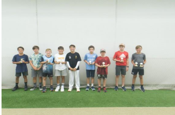
Our Y7 Rep team who the JT Sparling Trophy for their grade