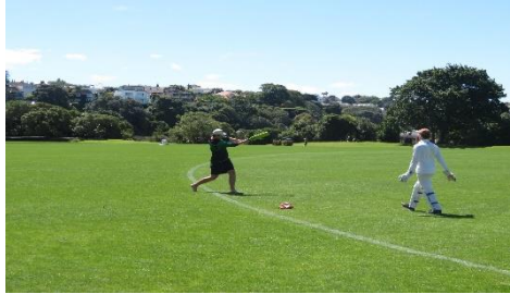
Pete hitting catches to our premier men`s team during warm ups

Q: Just a few months into the role with the 2021/22 season on the horizon we were plunged into an extended covid lockdown how did you find trying to navigate those challenges?