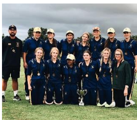
Auckland Champions Epsom Girls Grammar School had strong PCC representation this season

With an ever improving premier team, numbers on the rise across the grades, a youth strategy from Y0 right through to Y13 and a large number of staff and volunteers on board to help implement those programmes female cricket at Parnell CC is likely to go from strength to strength over the years to come.