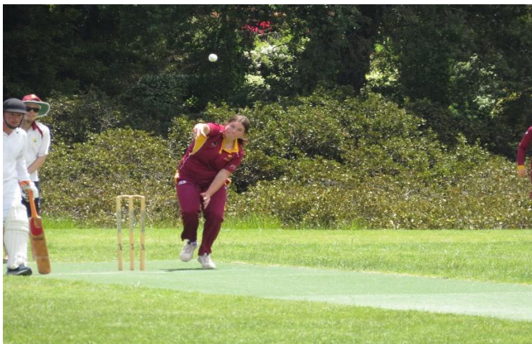
Eden Cotton bowling